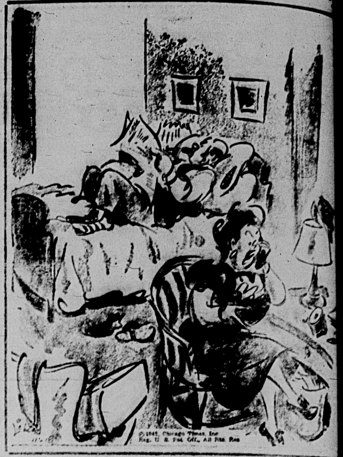
"We're living at a hotel now—our cook got so domineering that I decided to simply walk out of the house and show her we can go along without her!"