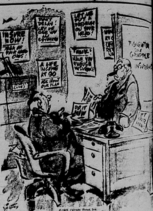
"I've rint into the same difficulty, Fignewton wants to join my car pool!