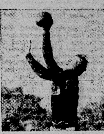
FORREST MCCAFFRY Purdue pass-catching end .