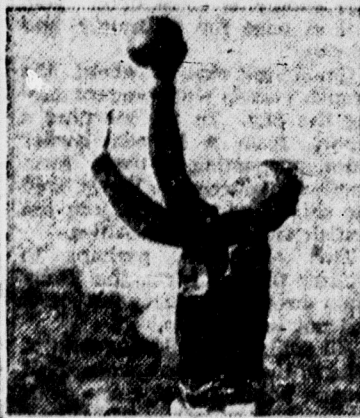
FORREST McCAFFRY... Purdue pass-catching end...