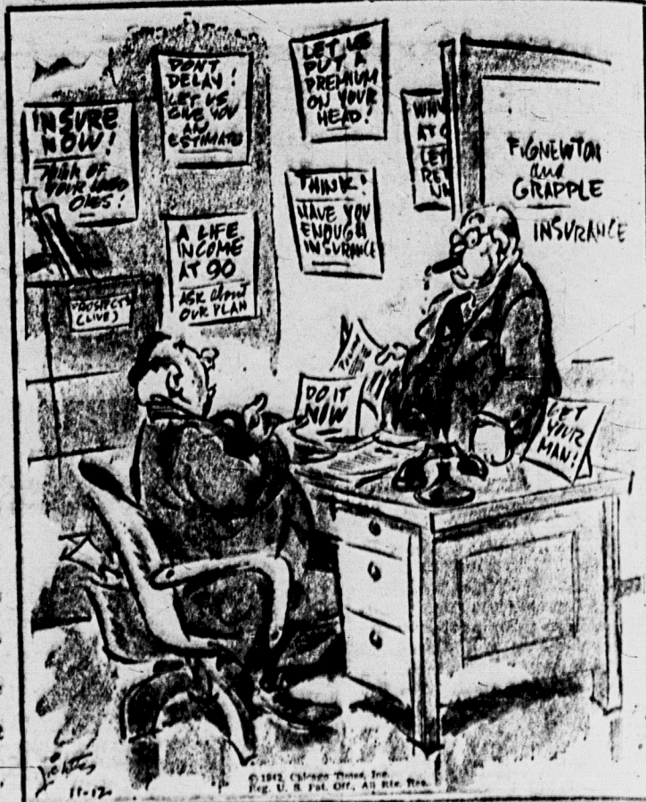
"I've run into the same difficulty, Fignewton -- nobody wants to join my car pool!"