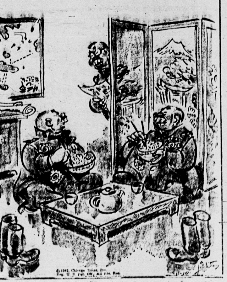
Hon. Spy report shortage of tin cans create desperate food crisis in U. S .- his private investigation prove only utensil in most kitchens is can opener!