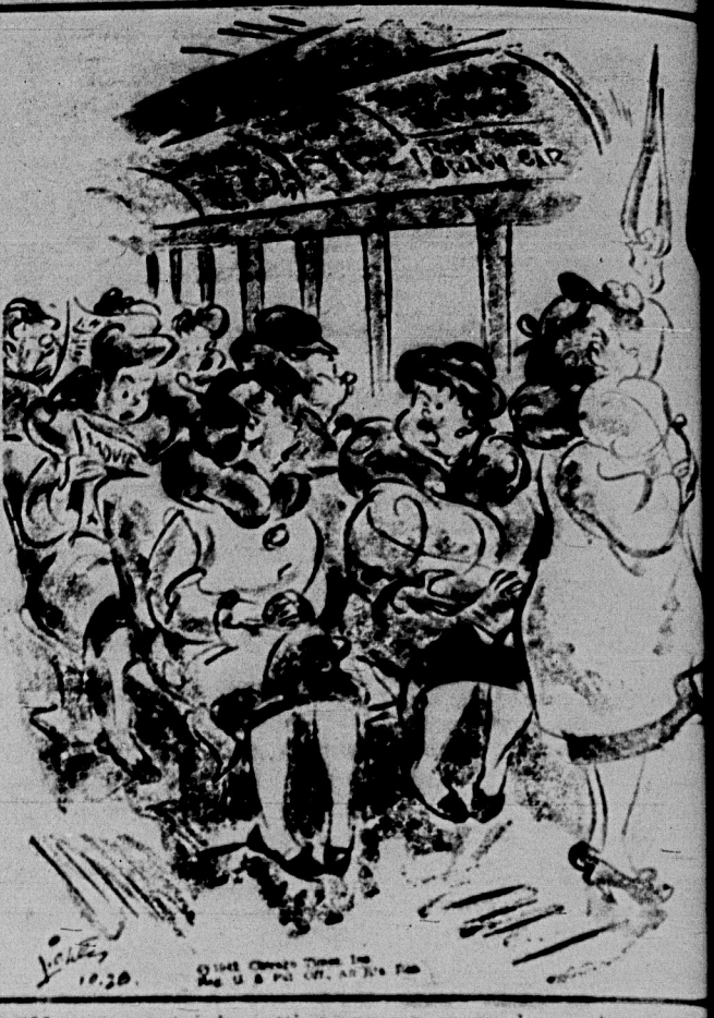
'Men are certainly getting scarcer every day-whe find a seat in a growded street car?