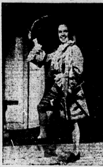
This youthful member of the Philadelphia Opera company is costumed for his role in "MARRIAGE OF FIGARO," to be presented in College auditorium this afternoon.

With the amusing story of the aspiring valet who climaxes the plot by boxing his master's ears, believing him to be a page, the afternoon's presentation, "Marriage of Figaro," is well known for its popular melodies heard See OPERA—Page 4