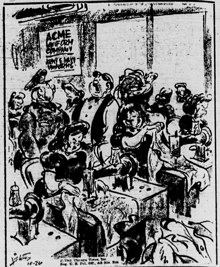
"Our problem here is morale, Colonel—trying to keep the girls crazy about uniforms!"