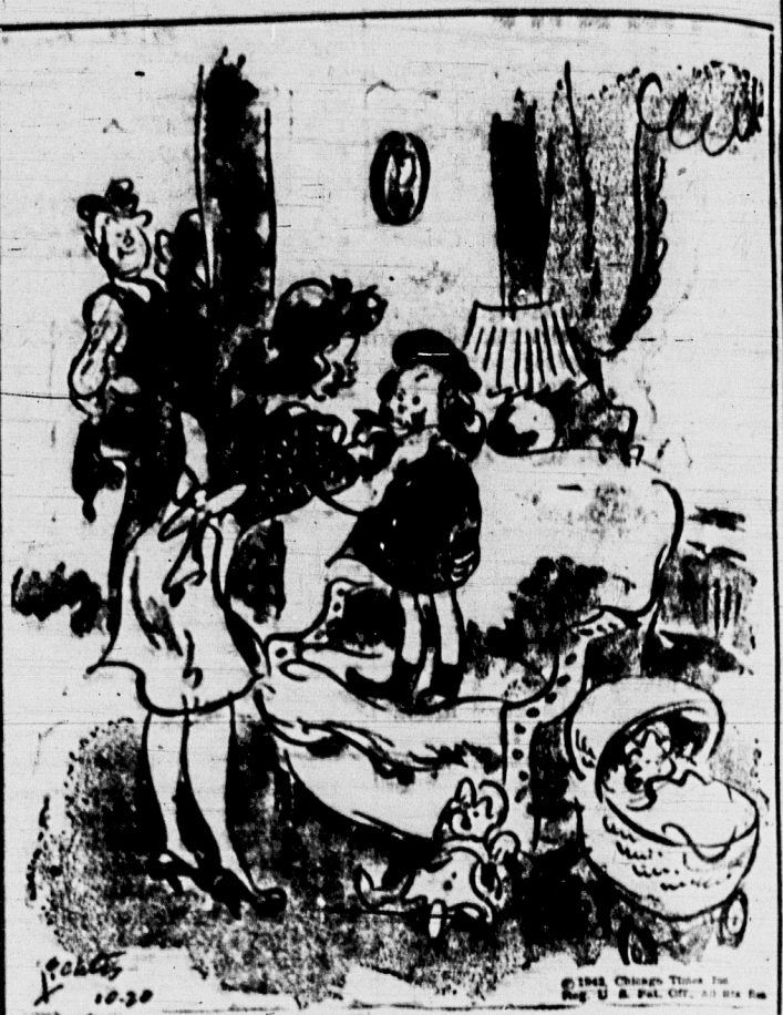
"When I was your age, I'd have given anything to be able to walk to school, but I was forced to ride in a stuffy car that smelled of sickening gasoline fumes!"