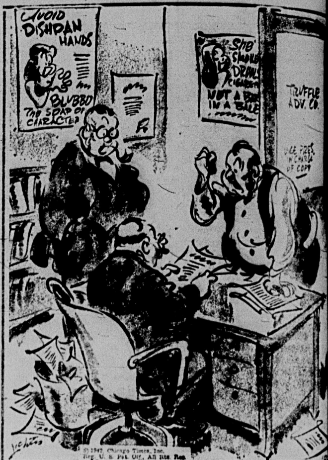
"I tell you 'dishpan hands' are dated—the women of America are worrying about 'mechanics hands' now!"