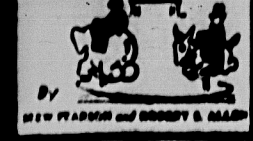
THE WASHINGTON MERRY-GO-ROUND