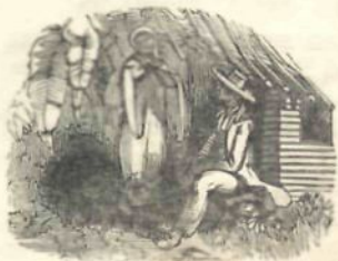
His mother discovering the young Teacher.