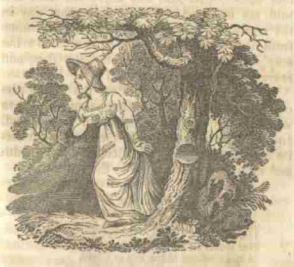
"In the warm season of the year, the adjacent woods was the place of her retirement, and there are several spots around our humble mansion, on which I never tread but as upon

At these seasons of devotion, I was not unfrequently permitted to be by her side, and listen to the ferrent breathings of her soul. In strains of deepest humility, she confessed her sins, acknowledged her obligations to her heavenly Father, and with great fervency prayed for complete conformity to the divine will. Her dear people were never forgotten, and her petitions were extended from them to all mankind.