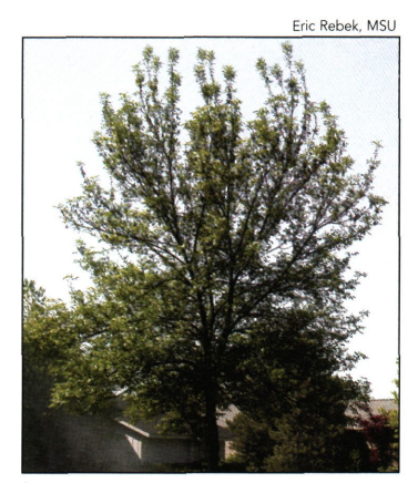
Ash tree exhibiting 40 percent dieback.

Insecticide products available for home use are Bayer Advanced Garden™ Tree and Shrub Insect Control, Bonide® Systemic Insecticide Bullets and ACECAP® 97 Systemic Insecticide Tree Implants. Caution: read all label instructions before using any pesticide, avoid skin contact, and store pesticides where children cannot reach them.