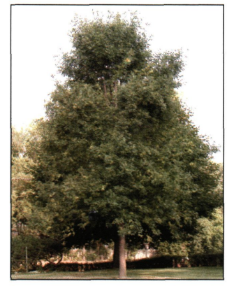
Healthy ash tree: no dieback.

Because of the expense of yearly treatments, it is important to weigh the decision to treat carefully. Consider the value of the tree in relation to treatment costs. Also consider the health of the tree. Research suggests that insecticide treatments may be able to save infested trees exhibiting low to moderate dieback (20 to 40 percent),