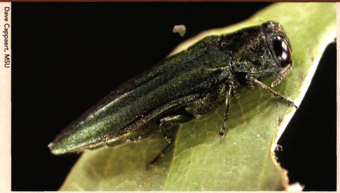
Emerald ash borer adult

Several insecticide products are available to homeowners for control of emerald ash borer (EAB). Treatments are needed every year to protect trees from EAB. Treatments are recommended only for homeowners in the quarantined area; it is not necessary to treat ash trees outside of this area. Treatments may be more effective if overall tree health is maintained. Therefore, it is important to fertilize trees in the fall or spring and water regularly.