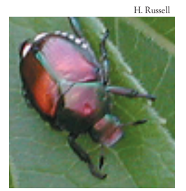
Popillia japonica Newman

Swollen ridges under the bark result from callus tissue that trees sometimes form over larval galleries. Adults may be present throughout the summer.