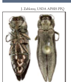
Agrilus anxius Gory