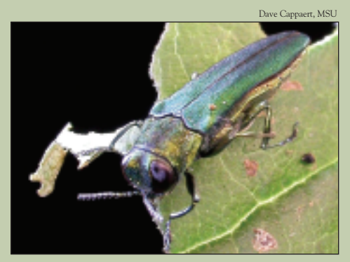
Emerald ash borer adult

This Asian beetle, discovered in 2002 in southeastern Michigan and Windsor, Ont., infests and kills North American ash species ( Fraxinus sp.) including green, white, black and blue ash. Damage is caused by the larvae, which feed in tunnels (called galleries) in the phloem just below the bark. The serpentine galleries disrupt water and nutrient transport, causing branches, and eventually the entire tree, to die. Adult beetles leave distinctive D-shaped exit holes in the outer bark of branches and the trunk. Adults are roughly 3/8 to 5/8 inch long with metallic green wing covers and a coppery red or purple abdomen. They may be present from late May through early September but are most common in June and July.