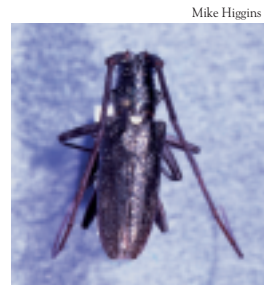
A male white-spotted sawyer beetle.