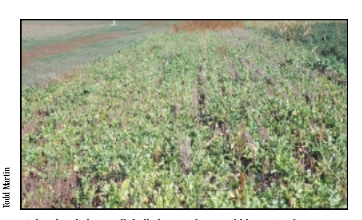
Oilseed radish no-till drilled into wheat stubble in October, 1999.

Many farmers used to frost seed red clover into wheat. This seeding practice usually occurs in March when the ground is frozen in the morning