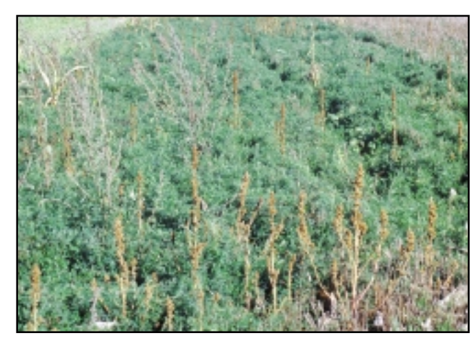
Hairy vetch no-till drilled in wheat stubble, October, 1999.

The highest yield (185 bu./A) resulted when 120 lb. N/A was applied to the oilseed radish (OSR) cover crop treatment. Yield in this treatment was significantly greater than with 0 lb. N/A and OSR;