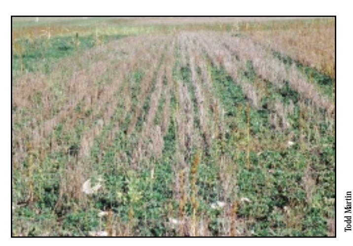
Crimson clover no-till drilled into wheat stubble, October, 1999.

and thaws in the afternoon—the freeze-thaw action shallow incorporates the clover seed in the soil. Most of the initial growth of the red clover plant is root development. The wheat grows aggressively in the spring and early summer, shading the red clover's top growth. In July, wheat is harvested, and the red clover now receives full sunlight and, with adequate moisture, grows. At KBS we have demonstrated that frost-seeded red clover can reduce common ragweed populations (Mutch et al., 2003). Red clover, a biennial that acts like a perennial, allows the farmer to mow weeds and clover, which decreases weed populations and stimulates red clover growth.