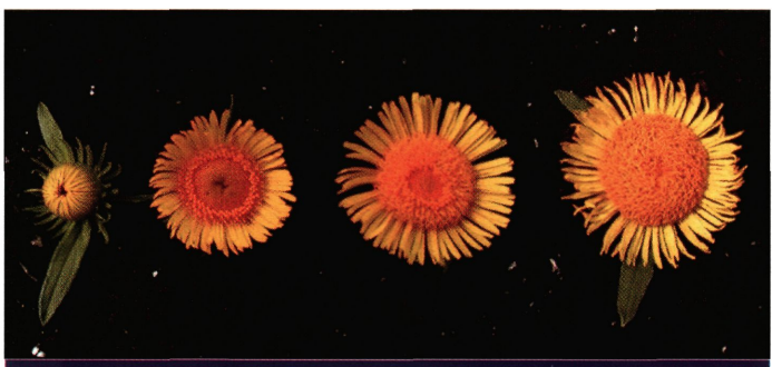
Figure 6. Maturation of I. britannica flowers.

The rosette form of this plant may slightly resemble horseweed (marestail, Conyza canadensis ), but horseweed is not perennial, and horseweed leaves have toothed margins with short, prominent petioles. Inula leaf margins are finely serrated, and coarse white hairs are easily distinguishable on the undersides of leaves and on the stem. The flowering stalk may grow up to 30 inches tall, depending on soil fertility. Few to many flowering branches may be formed on each plant.