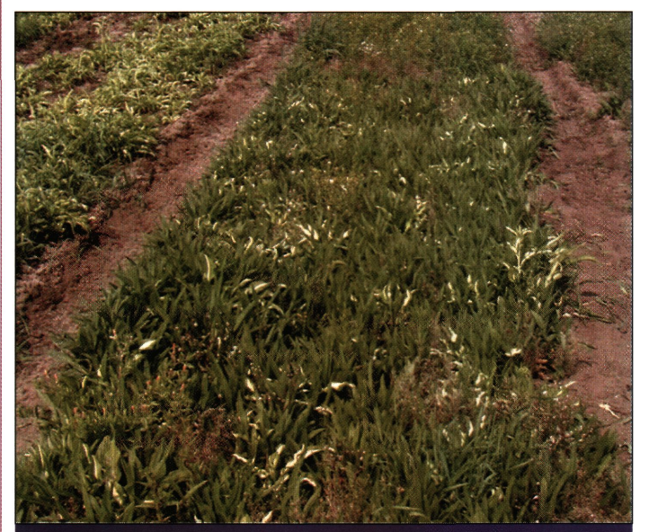
Figure 9. Untreated I. britannica forming a dense colony in hosta field.

Finale ) and triclopyr plus clopyralid ( Redeem R+P ) may control the weed in non-crop situations, but these products do not have adequate safety or a label for in-crop use. Clopyralid (Lontrel) also has shown promising results, but it cannot be used in all crops. Because inula is a perennial weed, multiple herbicide applications may be required. An active scouting and hand weeding program should be used in combination with chemical controls for long-term management.