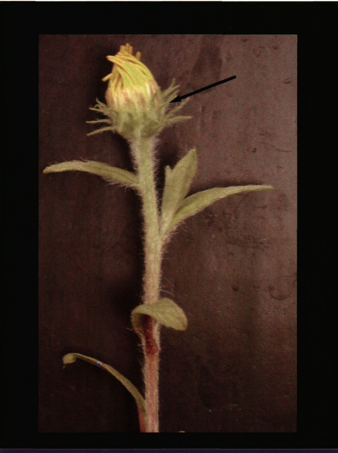
Figure 7. Linear, green, softly hairy bracts (arrow) on underside of I. britannica flower head.

Many coarse hairs are visible on I. britannica stems and leaves. Alternate leaves appear densely pubescent (hairy) below and lightly pubescent on the upper leaf surface. Lanceolate (narrow and tapering to a blunt tip) leaves have smooth to finely serrated margins. Leaves are sessile to slightly clasping the stem, and upper leaves will not have a petiole. Leaf tips are acute and bases are lobed in a rounded to arrowhead shape.