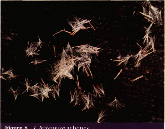
Figure 8. I. britannica achenes.

Most reports of rootstock contaminated with Inula have been attributed to hosta imported from the Netherlands, but inula may also be introduced with other species from other locations. State restrictions within the United States are likely to be less stringent than those of the Netherlands and may allow for interstate spread of the weed once it is introduced. This increases the importance of buying rootstock from reputable sources and maintaining a stringent prevention and sanitation program. Growers should inspect all imported root shipments for the presence of inula.