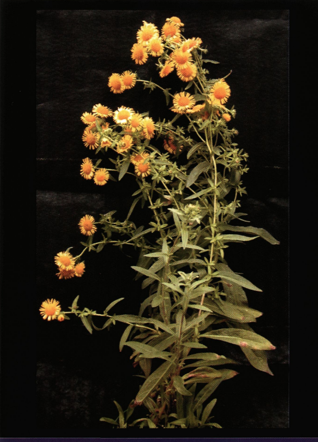
Figure 2. Mature I. britannica plant in full flower.

Inula britannica is a member of the aster or sunflower family. This plant is native to temperate climates in Asia and Europe and has been introduced into North America several times since 1915. Inula is known by several common names, including British yellowhead, British elecampane and xuan fu hua. The plant is reported to have medicinal properties and is currently being researched in attempts to isolate useful phytochemicals.