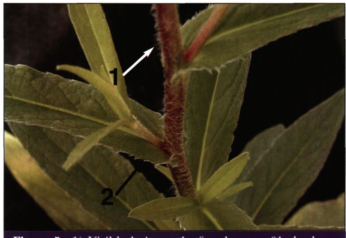
Figure 5. 1) Visible hairs on leaf and stem of bolted I. britannica plant; 2) small serrations on leaf margin.

Two other perennial inula species, I. helenium (elecampane inula) and I. salicina (willowleaf yellowhead), have the potential to become weedy. I. heleni um has become naturalized in the United States and may be found from North Carolina to Canada. This species may grow to 8 feet tall and also forms yellow flowers. I. salicina is uncommon in the United States and will likely not exceed 2 feet in height.