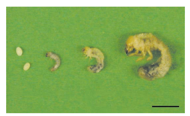
Figure 2. Relative sizes of eggs and first, second and third instar Japanese beetle grubs. Bar = 5mm.

Eggs are 1 to 2 mm in diameter, spherical and white (Figure 2). Females lay batches of eggs 5 to 10 cm below the soil surface, generally in areas with grass and moist soil.