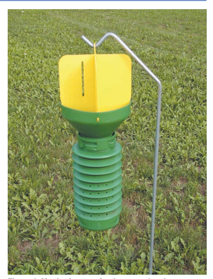
Figure 6. Monitoring trap for Japanese beetle.

Cultural control. One of the most effective control tactics is to make crop fields and nearby areas less suitable for Japanese beetle by integrating many cultural approaches into regular horticultural prac-