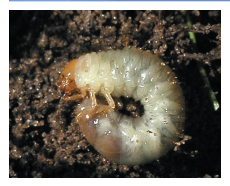
Figure 3. Fully grown third instar grub of Japanese beetle.

Larvae (also known as grubs) are 2 to 3 mm long when newly hatched; fully grown larvae are about 30 mm long (Figure 2). Larvae are C-shaped and white with a brown head capsule and three pairs of legs (Figure 3).