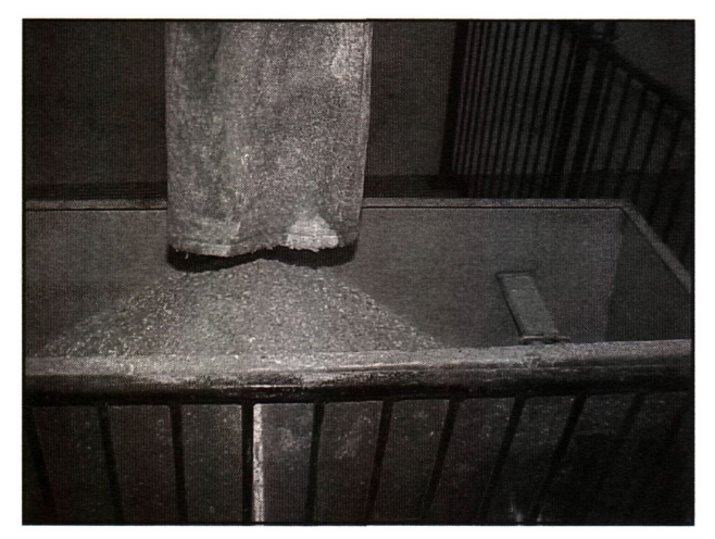
Figure 2. Placing covers over feed drop spouts can reduce dust.

After feed is delivered to a building or bin, the next challenge is getting it into the pig without it becoming waste. Again, equipment for moving the feed from the bin to the feeder should