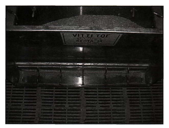
Figure 4. Feeders should be adjusted so that less than one half of the trough bottom has feed exposed.

reduction in total time at the feeder<sup>(2)</sup>.