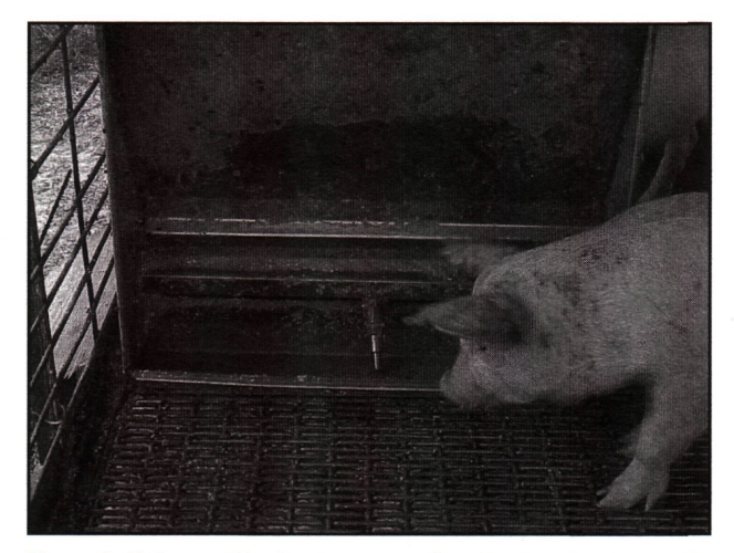
Figure 3. Using wet/dry feeders can reduce feed and water waste.

Select a feeder that is designed to reduce waste. Feeders that allow pigs to eat upright while standing at the feeder will reduce waste by preventing the pig from backing out of the feeder to eat in a natural upright position. The lip on a feeder should be high enough to restrict spilling but not more than 8 inches. Lip heights greater than 8 inches result in pigs stepping into the feeder and wasting feed. Because eating a dry feed necessitates drinking, feeders that combine a water supply with the feeder such as wet/dry feeders (Figure 3) reduce the need for pigs to walk away from the feeder to get water. Locating a water source near the feeder can also reduce feed waste by minimizing movement.