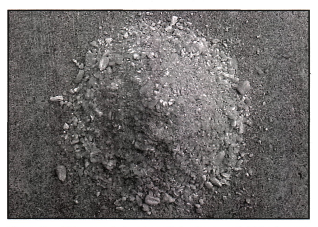
Figure 5a. This sample has a particle size over 1,000 microns.

swine diets to decrease the amount of feed necessary for pigs to consume in order to meet their requirements is an effective way to reduce feed waste. Adding fat to diets is one way of increasing the energy density of diets and improving feed efficiency and reducing feed waste. For each 1% of fat added to a grower/ finisher diet, feed efficiency will be improved by approximately 2%. Fat additions can also reduce the formation of dust, which is another source of feed waste. Many producers routinely add fat at 1% of the ration to reduce dust.