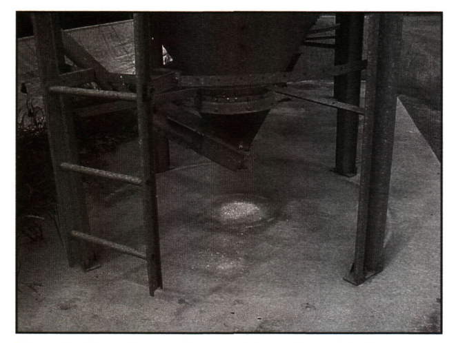
Figure 1. Reducing waste caused by equipment leaks can save feed and prevent rodents and insects.