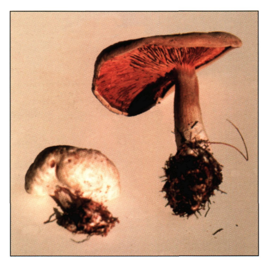
Entoloma abortivum. Aborted form on left.

These species are characterized by a pink to red spore color and angular spores (visible under a microscope). Most species are poisonous. Many books will list as edible Entoloma abortivum, which occurs in association with the honey mushroom, Armillaria mellea. To make matters confusing, both the aborted and nonaborted forms (see picture) are called E. abortivum, but the aborted form is actually primarily the honey mushroom, which is being parasitized by the Entoloma. The aborted fruit bodies are edible: nonaborted Entolomas should not be eaten. because of the possibility of confusion with poisonous species. Entoloma abortivum grows on or near wood in the fall; other Entoloma species grow on the ground in humus in wasteland and fields, along edges of bogs and in woodland areas. Many small species grow on rotting wood. They can be found during all seasons from early spring until late fall.