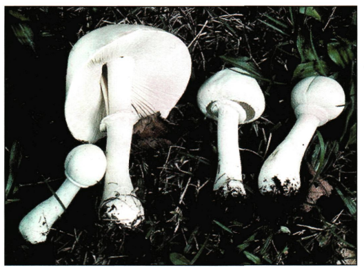
Lepiota (Leucoagaricus) naucina