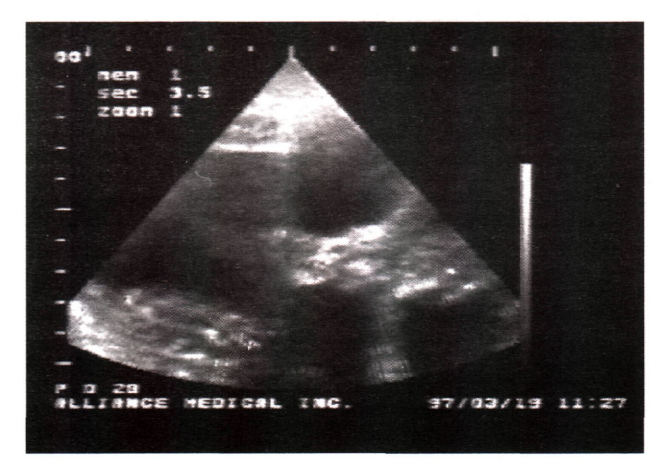
Figure 6. Real-time ultrasound image from a pregnant sow on day 21 of gestation. Note the series of small, solid, dark circles that represent fluid-filled pockets in the uterus.

False positives and negatives both occur most often when females are scanned during the first three weeks after breeding. In contrast to A-mode and Doppler ultrasonography, many of the situations that result in a misdiagnosis of pregnancy are eliminated with real-time machines because various aspects of the developing fetuses can be seen and more detailed images are provided for interpretation by the technician. For example, by examining images for the presence of fetal skeletons from sows between days 65 and 75 of gestation, 115 out of 138 non-pregnant females were diagnosed correctly on a commercial swine farm with a history of a high incidence of pseudopregnancy. In this situation, sows without fetuses had