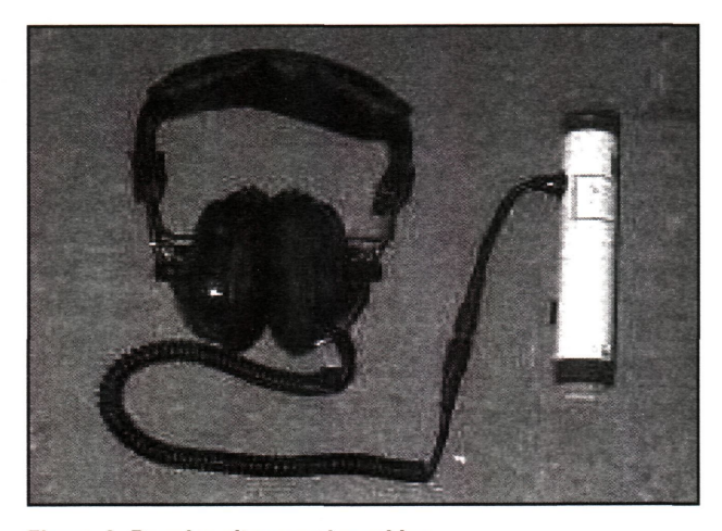
Figure 4. Doppler ultrasound machine.

The ultrasound waves from Doppler machines are used to distinguish the movement of objects such as the fetal heart and the pulsation of blood through umbilical vessels or uterine arteries in pregnant sows and gilts. Once the ultrasound waves from the Doppler probes encounter moving objects, they are reflected back to the probe with a similar frequency and converted to an audible signal by the receiving unit (Figure 4).