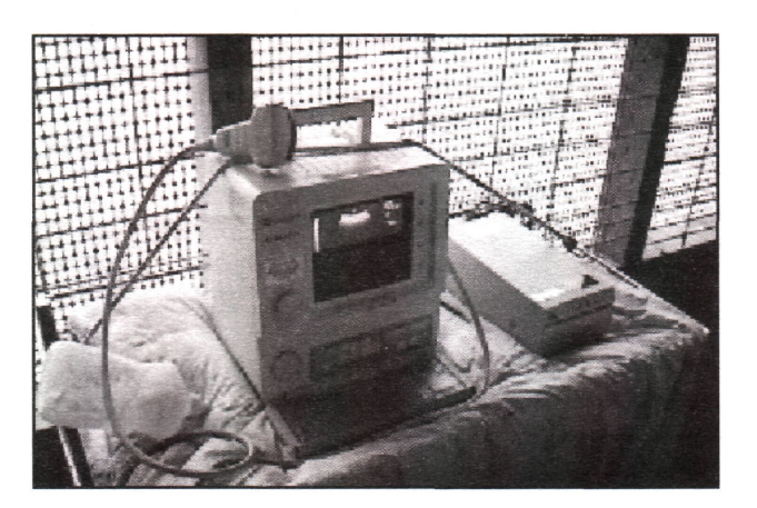
Figure 5. Real-time ultrasound machine.

Both controlled and field studies have demonstrated that use of real-time ultrasonography is a highly precise method of pregnancy detection in swine. On day 21 of gestation, the pregnancy status of 96% of the sows was diagnosed correctly in a research setting and greater than 93% accuracy was