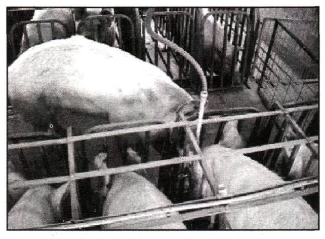
Figure 1. Daily detection of estrus with a mature boar as a form of pregnancy diagnosis. Note: the erect ears or "ear popping" response of sow in estrus.

Observation of physiological and behavioral signs of estrus after breeding is the most common method used for pregnancy diagnosis. If a sow or gilt becomes pregnant after breeding, the production of a hormone called progesterone is maintained until farrowing. High progesterone levels prevent the normal sequence of events that lead to estrus. Conversely, if pregnancy does not occur or is terminated prematurely, the progesterone levels decrease and physiological changes are initiated that