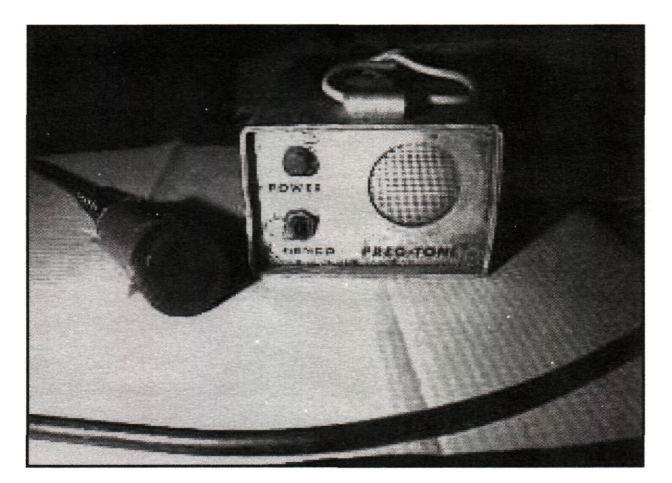
Figure 3. A-mode ultrasound machine.

However, between days 28 and 80 of pregnancy, it is not unusual for their accuracy to be greater than 95%. Prior to day 28 of gestation, the amount of fluid that accumulates in the uterus is variable among animals. After day 80 of pregnancy, the developing fetuses occupy the majority of the uterine lumen and deflect ultrasound waves. Consequently, the low accuracy prior to day 28 most likely is the result of insufficient accumulation of fluids for detection with A-mode machines and the reduced accuracy after day 80 is due to the presence of solid objects (fetuses) in the uterus.