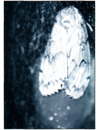
If you unknowingly transport egg masses to a new location,

Nope — gypsy moth is here to stay and is now a part of Michigan's forest and urban forest ecosystems. But you can help keep gypsy moth from spreading into new areas that are not yet infested. Gypsy moth females like to lay their egg masses in dark, protected locations such as the undersides of lawn chairs or picnic tables or on firewood. Egg masses may also be found on recreational vehicles or trailers or in the wheel wells of cars.