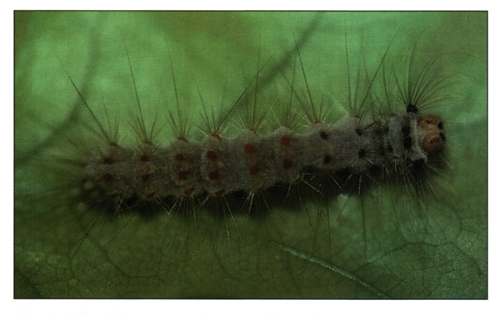
Figure 2. Dead larva covered with conidia of Entomophaga maimaiga.