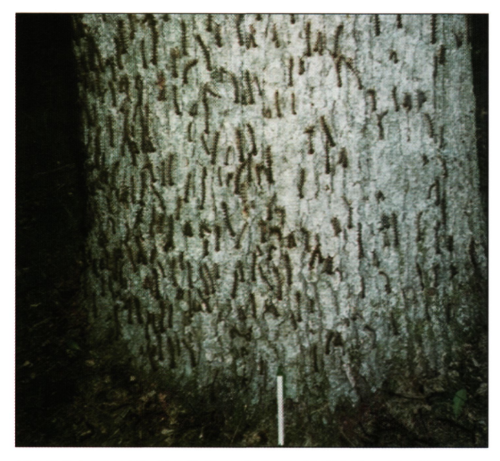
Figure 3. Larvae killed by Entomophaga maimaiga often remain attached to trees.