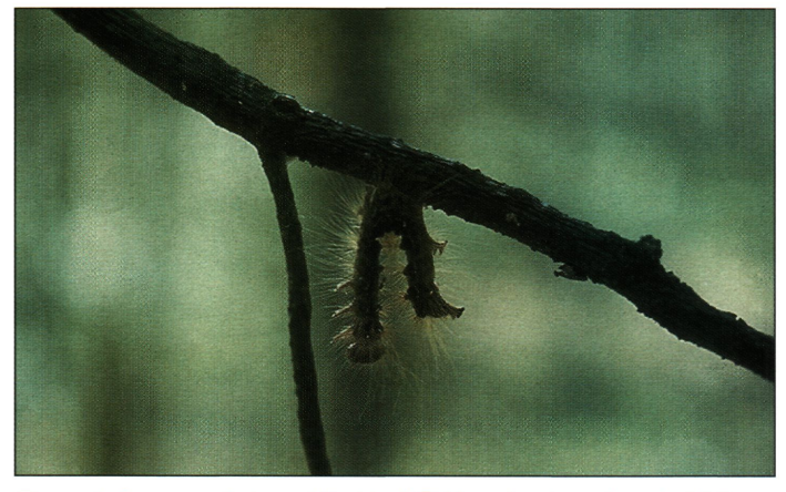
Figure 1. Gypsy moth larva killed by NPV hanging in an inverted "V" position.