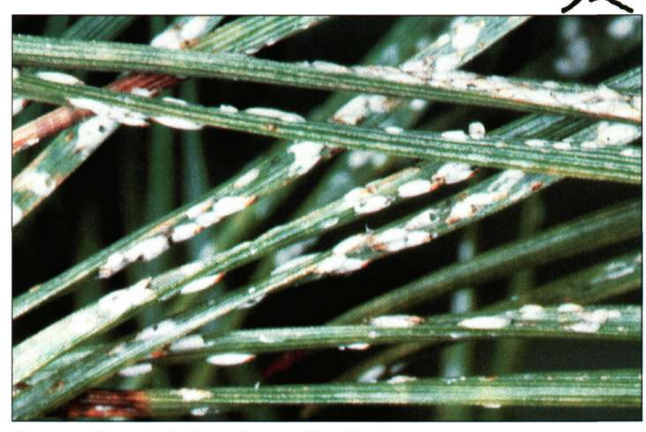
Pine needle scale infestation on Scotch pine

Adult female scales are easily recognizable and are the stage commonly seen on Christmas trees. Scales are white, "oystershaped" or oblong flecks on pine needles. Females lay reddish-brown eggs underneath the white scale covering in mid-August and then die. Eggs overwinter under the waxy white exoskeleton of the dead adult female. Eggs hatch the following spring, usually about mid-May to early June. The reddish-colored crawlers are the immature stage of the scale and are mobile. Crawlers move about the tree to find a suitable site for feeding and can be blown to surrounding trees or other fields by spring winds. Crawlers settle on a suitable needle, insert their strawlike mouthparts into the needle, and begin feeding on plant sap. Scales feed and grow for several weeks, then mature into adults in early July. Scales mate and a second generation is produced about mid-July. This generation of scales feeds until mid- to late August, when eggs are laid and females die.