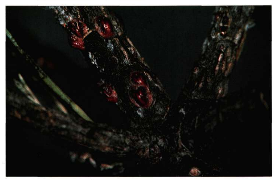
Pine tortoise scale infestation

Each fertilized female can produce up to 500 immature scales called crawlers. Crawlers are the mobile stage of the pine tortoise scale, and are usually present in mid- to late June. The tiny crawlers are yellowish-red in color. Crawlers will disperse and