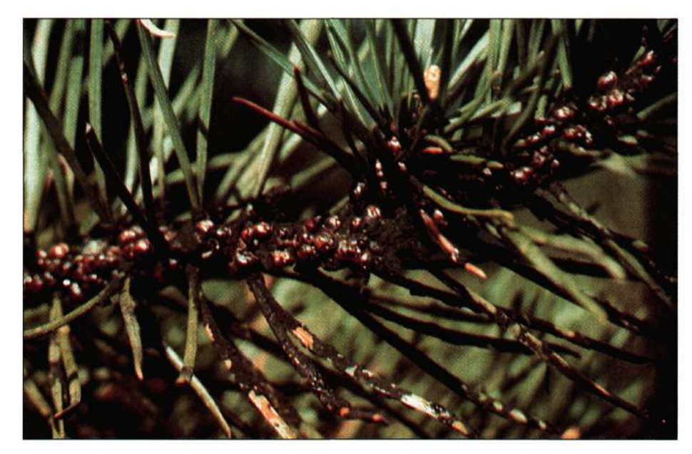
Scotch pine shoot with pine tortoise scale and black sooty mold

Scout fields regularly to identify pine tortoise scale infestations while populations are small. Shearing trees after crawlers have settled will eliminate a large amount of the scale population. Minimize contact among trees to slow the spread of crawlers from one tree to another. Heavily infested trees should be rogued out of fields and destroyed. However, do not transport heavily infested trees through the field while crawlers are active in mid- to late June. Controlling ants in