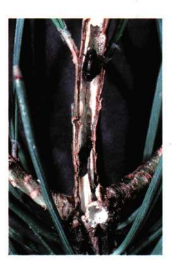
Figure 2. Mined shoots of Scotch Pine. (Arrow indicates entrance gallery)

Tomicus piniperda completes one generation per year throughout its native range of Europe and Asia. Overwintering adults initiate flight on the first warm (50-54°F) days of spring which probably occurs in February or March in the Lake States in the northeastern United States. Adults quickly colonize either recently cut pine stumps, logs, or, at times, infest the trunks of severely weakened trees. If necessary, adults can fly 1/ 2 mile (1 km) or more in