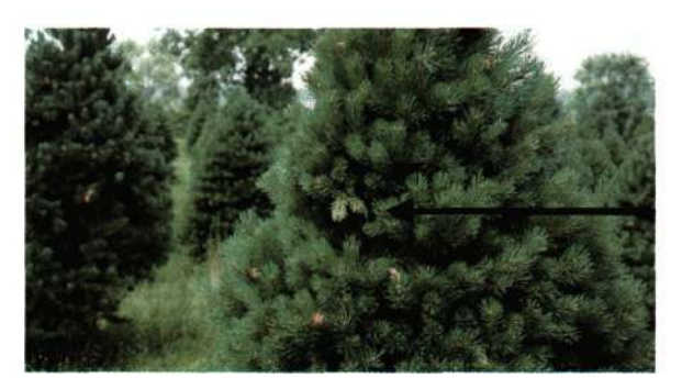
Figure 3. Damaged shoots on Scotch Pine.

In the Lake States, adults exit twigs soon after the first frosts in October and November and enter the thick bark at the base of pine trees to spend the winter. Adults typically overwinter at the base of the same pine tree that supported their maturation feeding. A few beetles may pass the winter inside twigs in the crown.