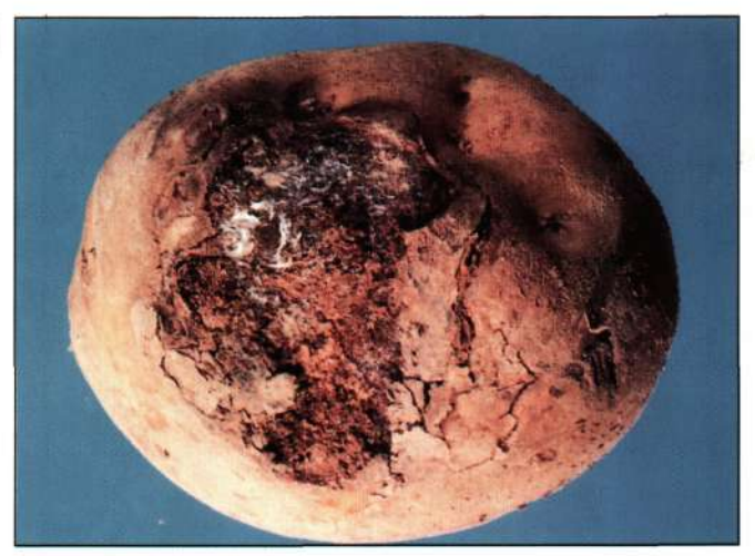
Figure 1. External tuber symptoms of Fusarium dry rot.