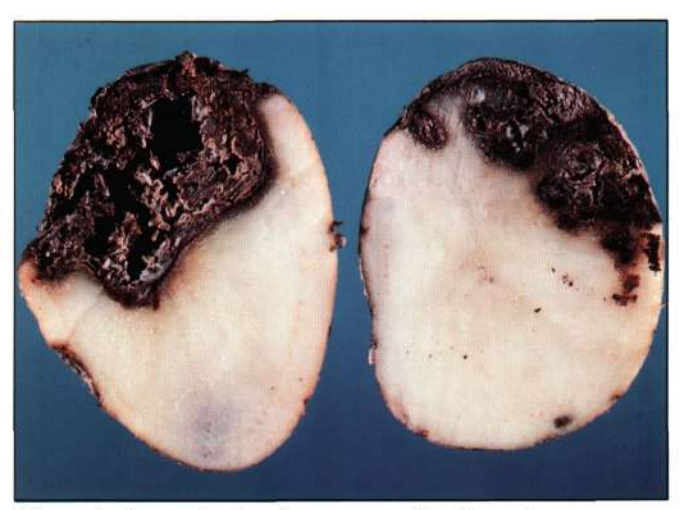
Figure 2. Internal tuber decay caused by Fusarium Sambucinum .