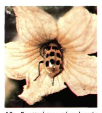
10. Spotted cucumber beetle