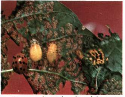
Mexican bean beetle adult, pupa, larvae, eggs, and damage