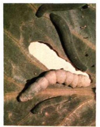
Cabbage looper (light green) and imported cabbageworm (dark green)

For safe and effective use of insecticides, always identify the problem correctly.