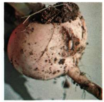
8. Root maggot and damage