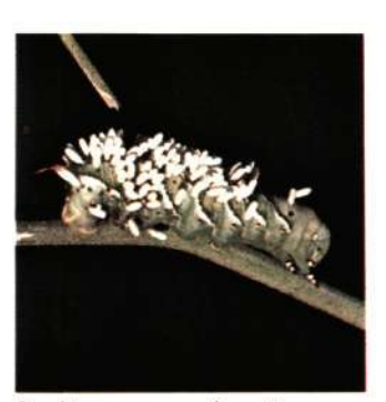
Hornworm showing cocoons of parasite on back