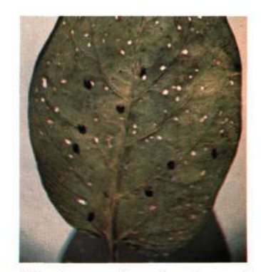
Potato flea beetle and damage