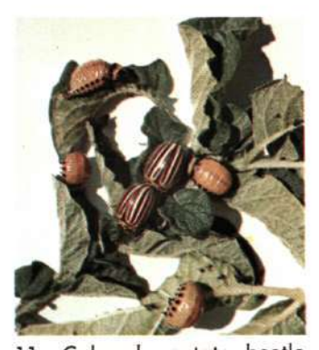
. Colorado potato beetle larvae and adults