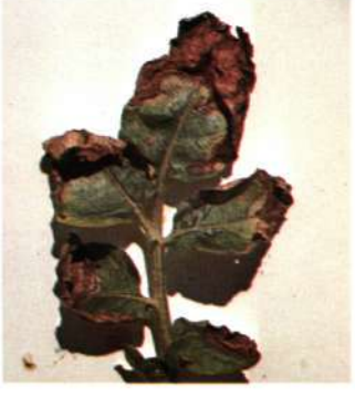
14. Squash vine borer and damage