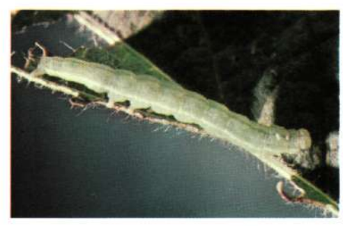
6. Green clover worm