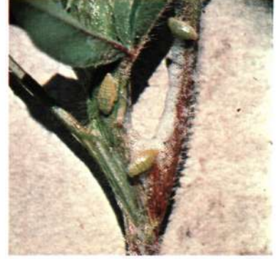
Meadow spittlebug and nymphs