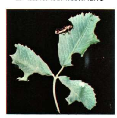
Sweet clover weevil and typical damage