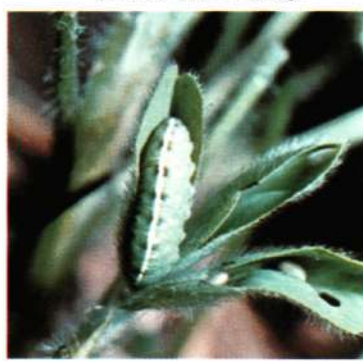
2. Clover leaf weevil larva