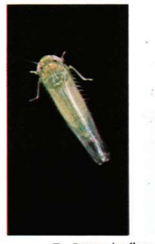
Potato leafhopper (greatly enlarged) and leafhopper damage to alfalfa