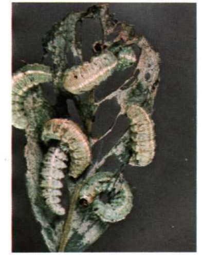
Alfalfa weevil adult, and larvae and damage