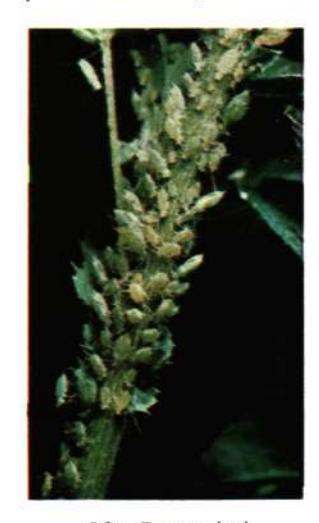
10. Pea aphid