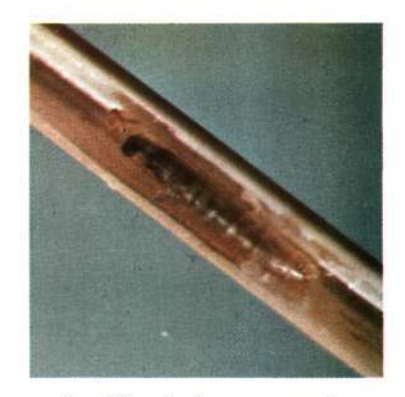
8. Wheat stem maggot