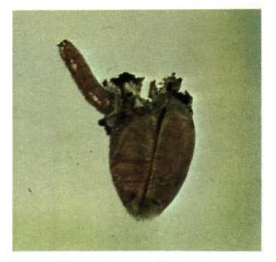
11. Wireworm and damage to seed

Prepared by Extension Entomologists of the North Central States in cooperation with the Federal Extension Service, U.S. Department of Agriculture