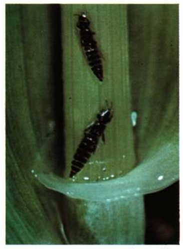
3. Thrips (greatly enlarged)