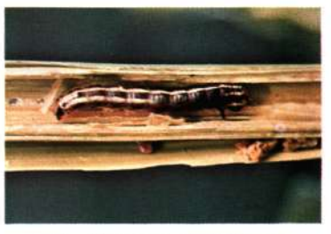
10. Common stalk borer