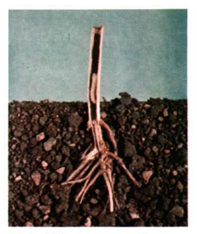
9. Wheat stem sawfly