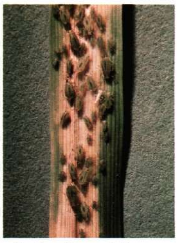
2. Greenbug and damage

1. Cereal leaf beetle adult, eggs, larva, and damage