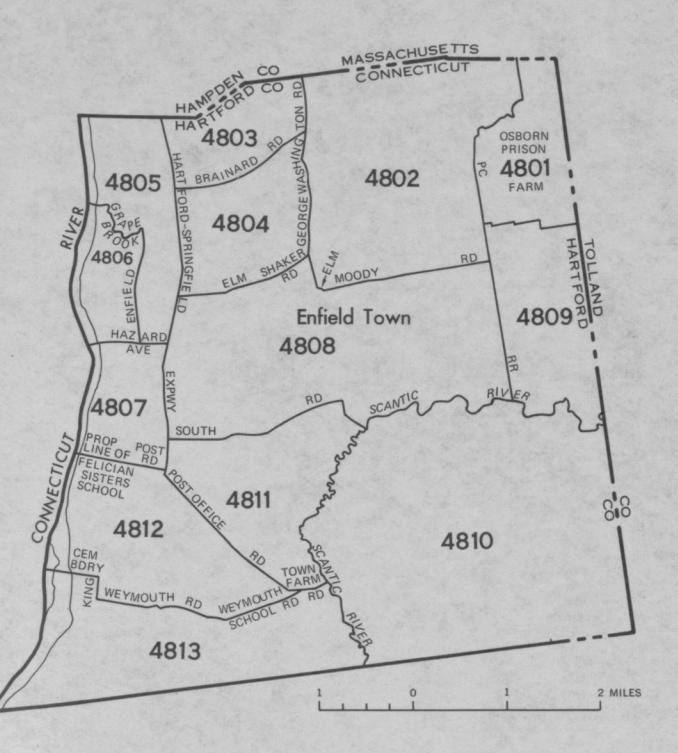
INSET B - ENFIELD TOWN