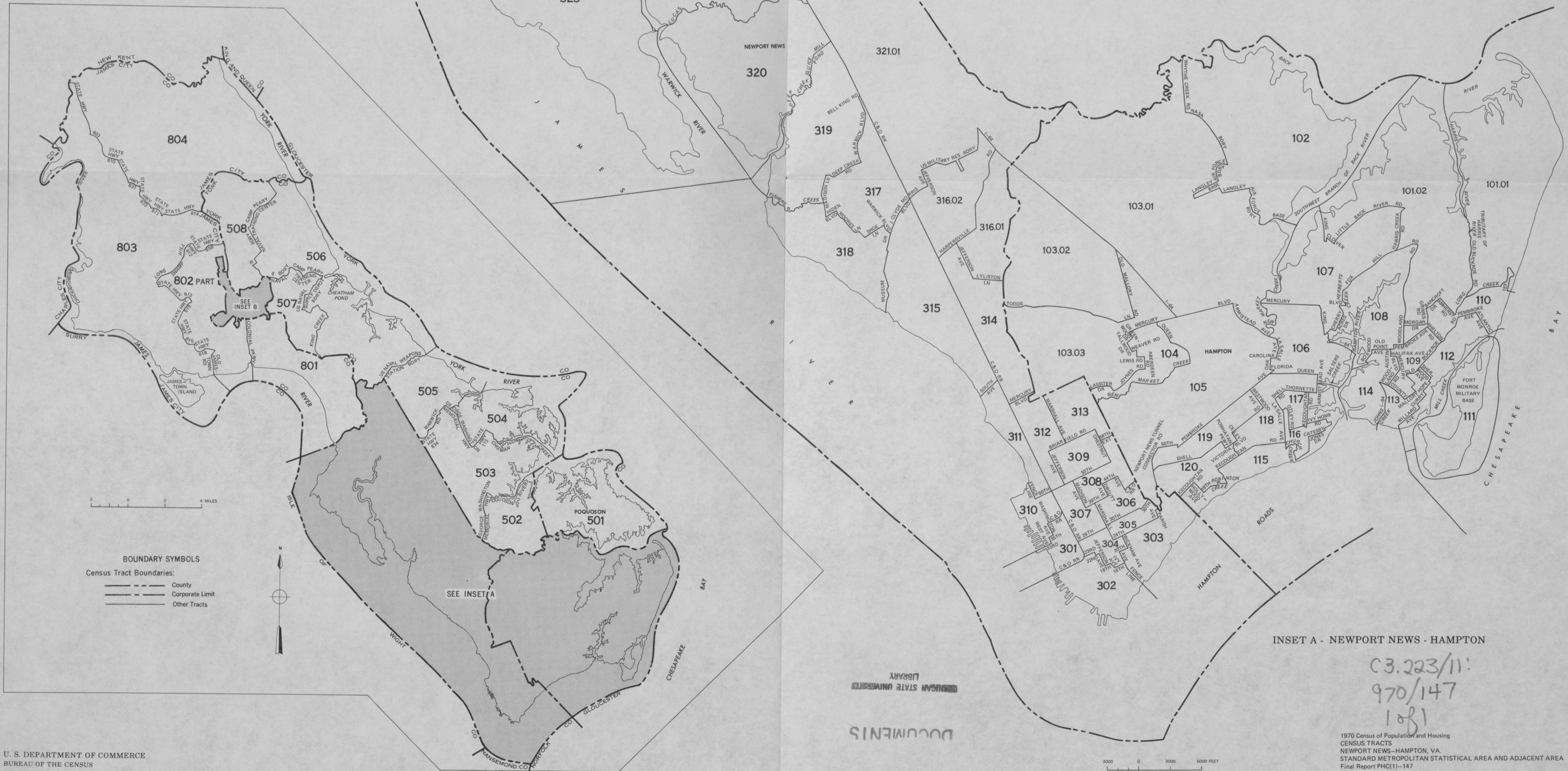
INSET A - NEWPORT NEWS - HAMPTON