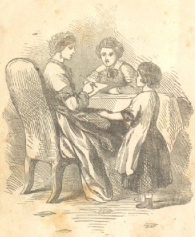
Writing the Notes.