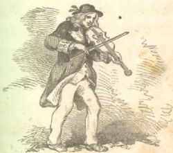
The Old Fiddler.