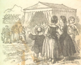
On the Lawn.