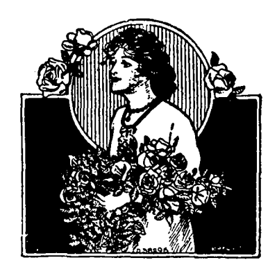
"Say It With Flowers"