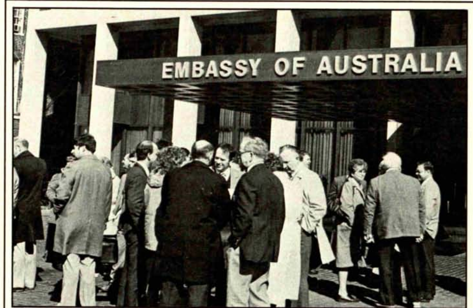
The Australian Embassy hosted a meeting for the Michigan group where the legislative leaders learned about Australian agriculture and the country's agricultural programs.

aides for further discussion on priority issues before meeting with USDA officials in the afternoon.