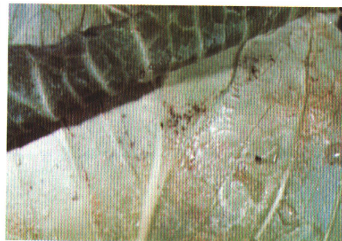
11. Onion thrip leaf damage