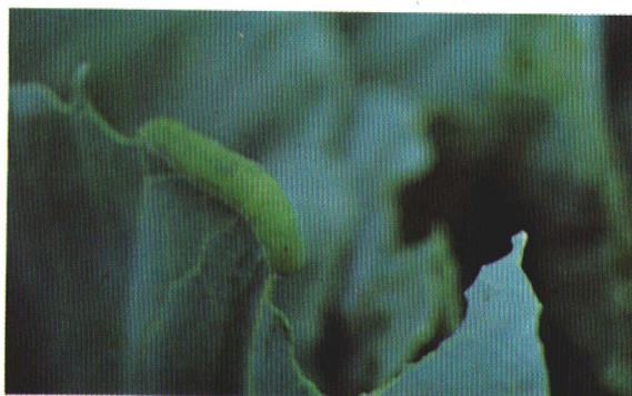
4. Imported cabbageworm larva