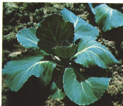
2. Cabbage maggot (left: damaged plant; right: healthy plant)