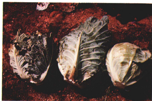
5. Imported cabbageworm and looper damage (undamaged head on right)