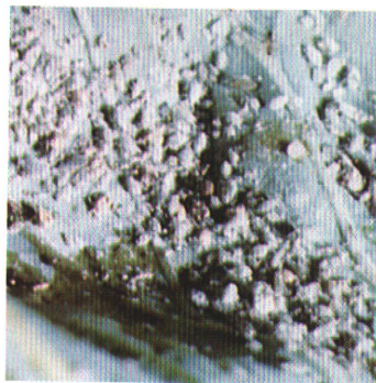
9. Cabbage aphids (left) and damage (right)