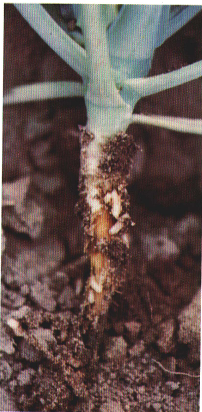
1. Cabbage maggots and damage to roots