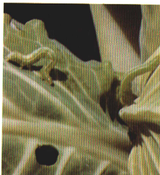
7. Cabbage looper