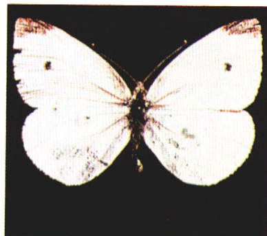
3. Imported cabbageworm adult