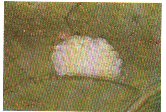
6) European corn borer—egg mass (on pepper)