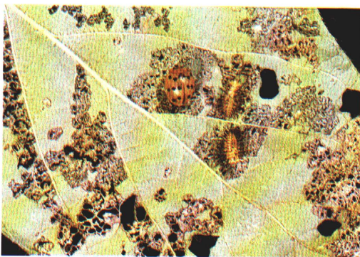
10) Mexican bean beetle—adult, left; larvae, right