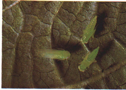
2) Bean leafhopper adult—left; immatures—right