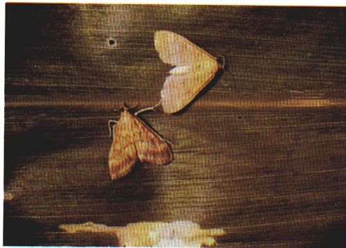
5) European corn borer—adults