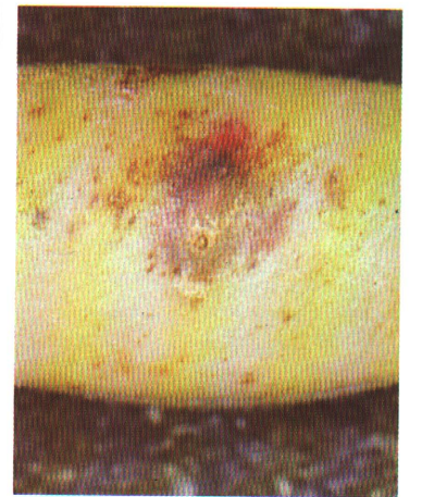
9) European corn borer entry hole in pod