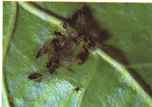
11) Black bean aphids