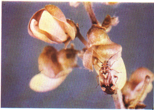
4) Tarnished plant bug on bean blossom