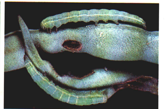
12) Green cloverworm on bean pods