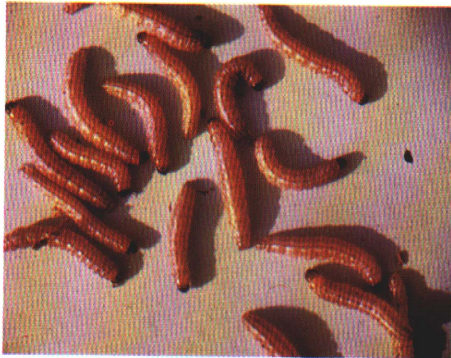
7) Full-grown European corn borer larvae