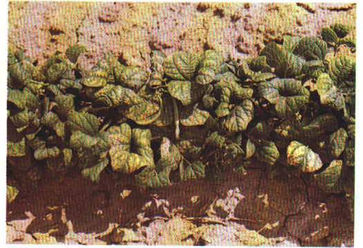
3) "Hopper burn" damage by leafhoppers