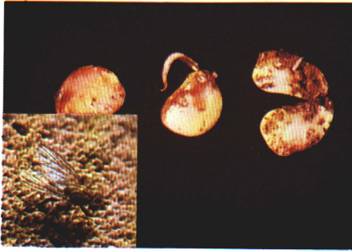
1) Seed corn maggot (inset—adult) & maggot damage to beans