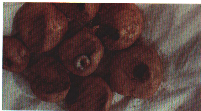
3. White grub damage to potatoes