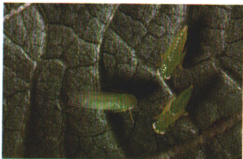
8. Potato leafhoppers—adult (left); immatures (right)