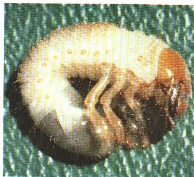
1. White grub larva