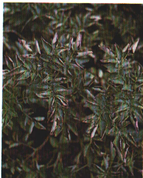
12. Potato leafroll disease