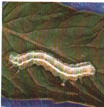
13. Cabbage looper