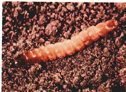
2. Wireworm larva