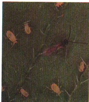
11. Green peach aphids (left); nymphs and wasp parasitoid (right)