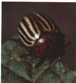
5. Colorado potato beetle adult