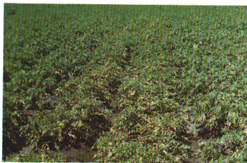
9. Potato leafhopper damage (note yellowish color in 2 rows)