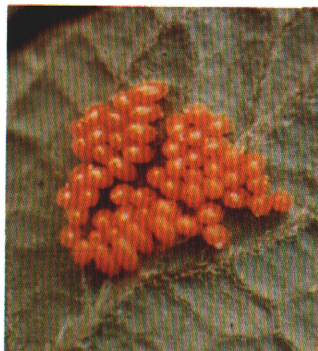
6. Colorado potato beetle eggs