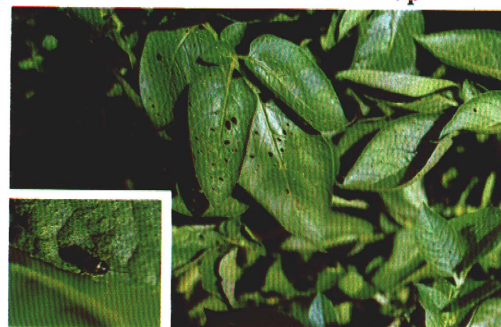
10. Potato flea beetle (inset) and damage