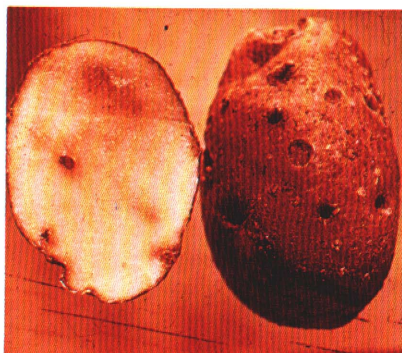
4. Wireworm damage to potatoes