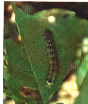
14. Variegated cutworm