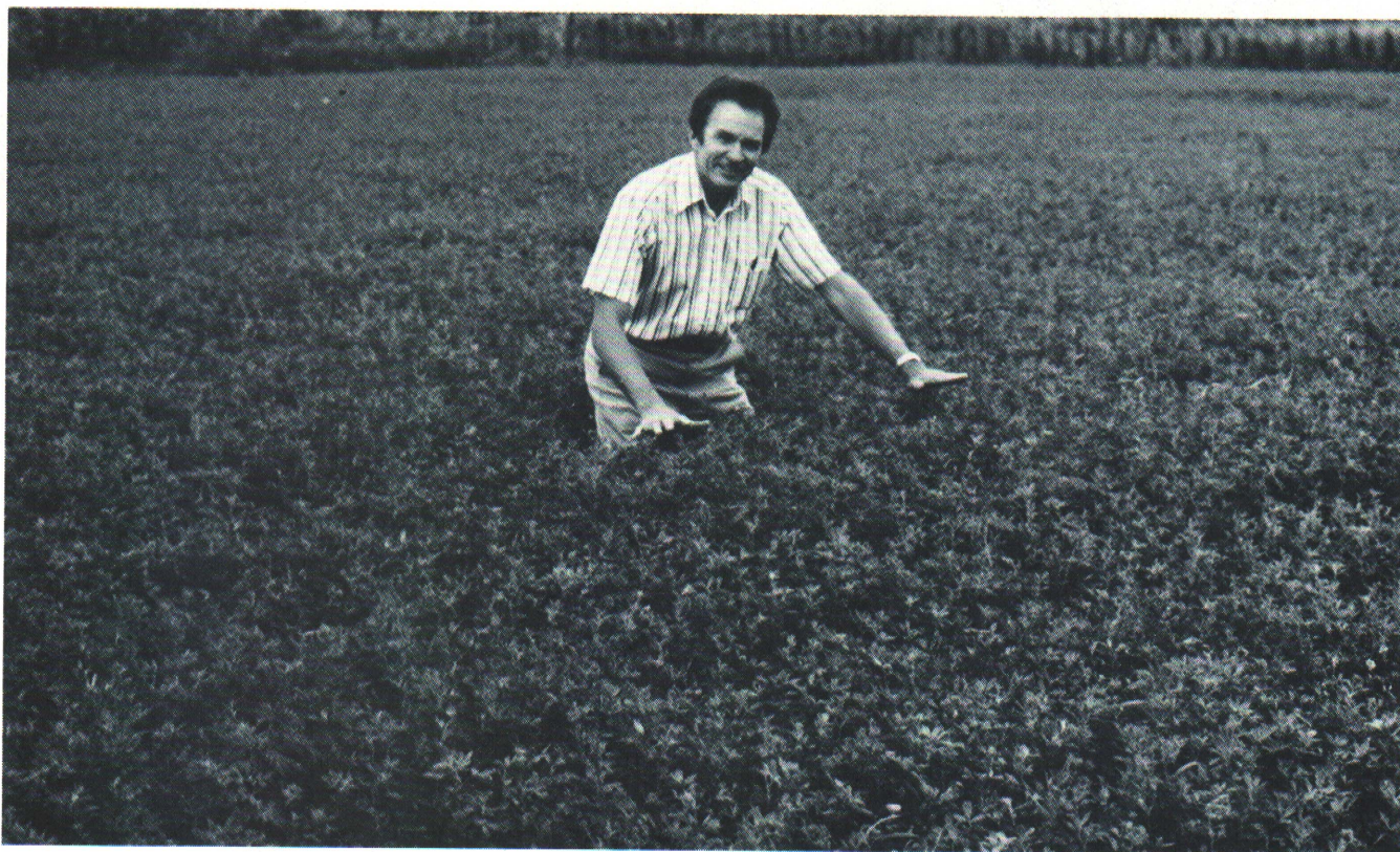
Fig. 6. Second cutting in mid-August, 1974, of a clear seeding made in late April after preplant treatment with Eptam to control annual weeds. The total yield of three cuttings was over three tons hay. Clinton county, tilled conover loam soil.