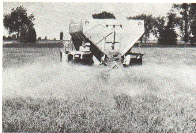
Fig. 2. Adequate lime should be applied, preferably 6 to 12 months before seeding, and incorporated to bring the pH to 6.8 or above.

[3] Test the soil and correct the pH by liming to 6.8 or above (Fig. 2).