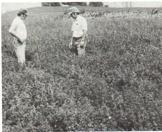
Fig. 5. First cutting alfalfa in early July 1975, in Oceana county yielded two tons hay per acre after a clear seeding made in early May. Eptam was used, preplant, at three pounds active ingredient per acre. The second cutting yielded one ton hay per acre.

[10] Use press wheels on the drill (Fig. 3) or tow a cultipacker (Fig. 4) behind the drill to firm the soil around the seed and cover it shallowly for fast emergence.