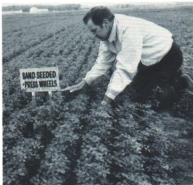
Fig. 1. An excellent stand is necessary for high yields in the seeding year. Twelve pounds per acre, band seeded with press wheels, were used in this seeding.