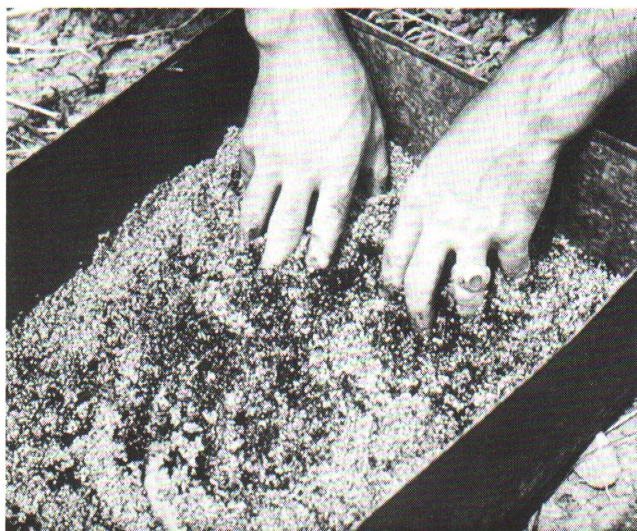
Fig. 2. Moist inoculation of birdsfoot trefoil or alfalfa with specific Rhizobia inoculant just before seeding is necessary.

One pound 2,4-D ester active ingredient per acre should be applied about 7 to 10 days before seeding to kill most broadleaved weeds, particularly dandelion. If 2,4-D is not used, the stand may be crowded out by the perennial broadleaved weeds.