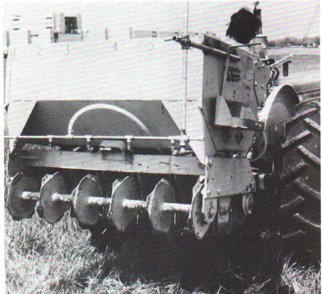
Fig. 4. The Zip Seeder, specially designed to seed legumes and grasses with fertilizer, has produced good stands in sods suppressed with paraquat.

Birdsfoot trefoil will not produce much forage the first year but should be well established in the grass in the second year. Alfalfa may produce up to a ton of dry forage the first year.