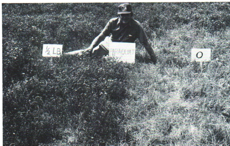
Fig. 1. Excellent stand of birdsfoot trefoil two years after seeding (see drill, Fig. 3) in a paraquat-treated bluegrass-timothy-brome grass sod.

*Sprayed, 1/2 lb paraquat active ingredient per acre plus X-77 surfactant.