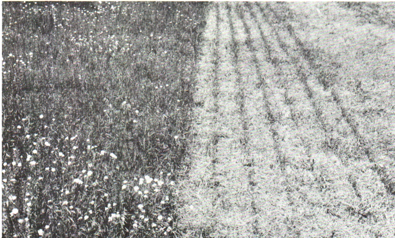
Fig. 5. Paraquat suppressed a bluegrass-brome-timothy sod adequately for an excellent stand of alfalfa seeded at 12 pounds per acre with a Zip Seeder. (Spinks loamy sand soil.)

Rotational grazing will help establish and maintain a good trefoil stand. Rotational grazing is absolutely necessary to maintain alfalfa.