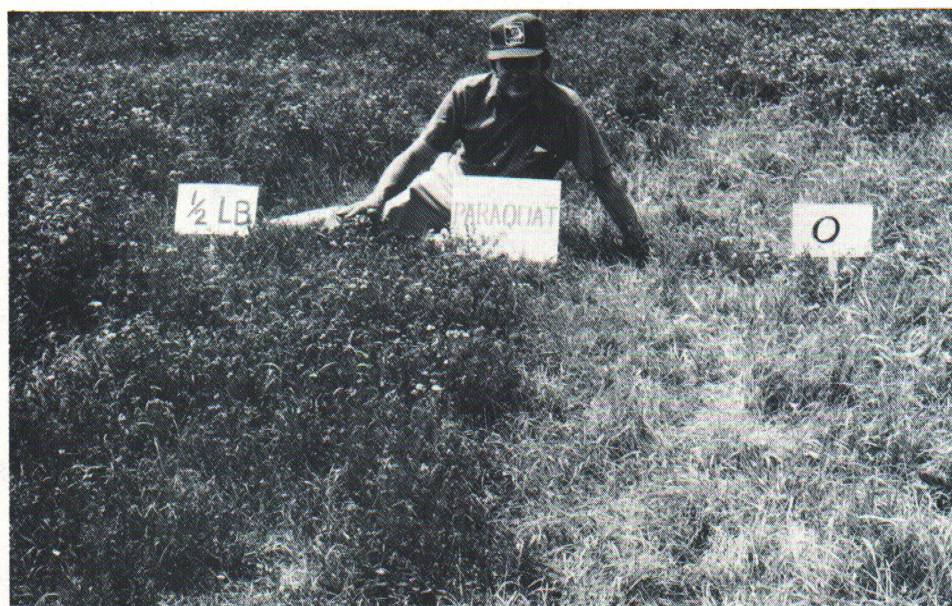
Fig. 1. Excellent stand of birdsfoot trefoil two years after seeding (see drill, Fig. 3) in a paraquat-treated bluegrass-timothy-brome grass sod.

*Sprayed, 1/2 lb paraquat active ingredient per acre plus X-77 surfactant.