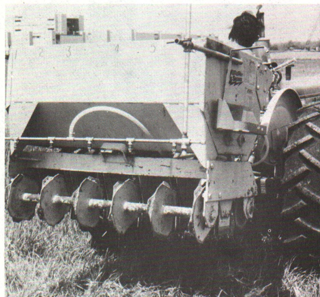
Fig. 4. The Zip Seeder, specially designed to seed legumes and grasses with fertilizer, has produced good stands in sods suppressed with paraquat.

Birdsfoot trefoil will not produce much forage the first year but should be well established in the grass in the second year. Alfalfa may produce up to a ton of dry forage the first year.