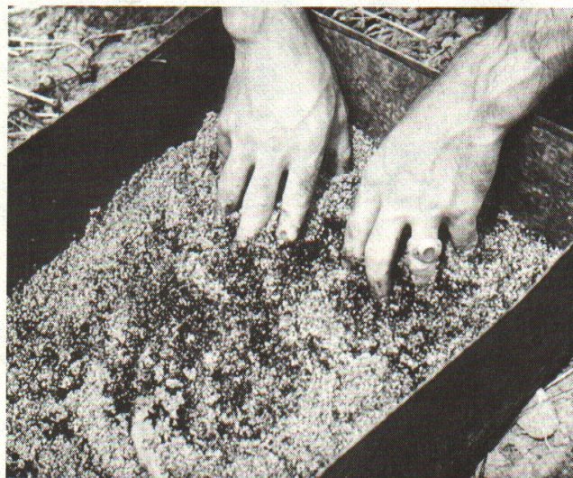
Fig. 2. Moist inoculation of birdsfoot trefoil or alfalfa with specific Rhizobia inoculant just before seeding is necessary.

One pound 2,4-D ester active ingredient per acre should be applied about 7 to 10 days before seeding to kill most broadleaved weeds, particularly dandelion. If 2,4-D is not used, the stand may be crowded out by the perennial broadleaved weeds.