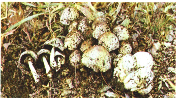
Coprinus atramentarius (scaly form) - edible

Only when consumed along with an alcoholic beverage does this mushroom prove disastrous.