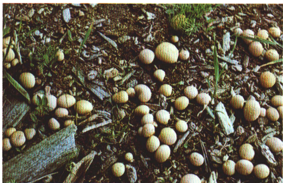
Lycoperdon pyriforme - edible

Large masses of several edible puffballs can be found on wood waste.