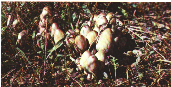
Coprinus atramentarius (smooth form) - edible

Only when consumed along with an alcoholic beverage does this mushroom prove disastrous.