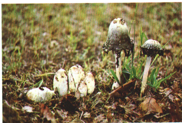
Coprinus comatus - edible

Try to visualize a shape similar to a hen's egg, the same width, about 2 inches, but stretched to stand 4 to 6 inches tall to resemble a bullet. That is the approximate shape of the cap of C. comatus as it pushes up through the soil. The very young buttons are covered with a grayish-brown skin that breaks to form large scale-like masses as the cap grows larger. The scales look like ruffled feathers. The cap color beneath the dingy scales is white.