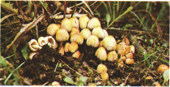
Coprinus micaceus - edible

Though the caps are small, it is not difficult to gather sufficient quantity for a meal.