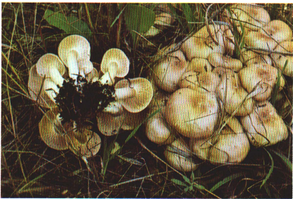
Lyophyllum decastes - edible

L. decastes grows in places other than mill yards if the soil is rich in decayed humus — along roadways, around haystacks or undisturbed areas of barnyards.