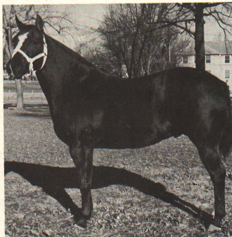
The same horse too fat for work and show