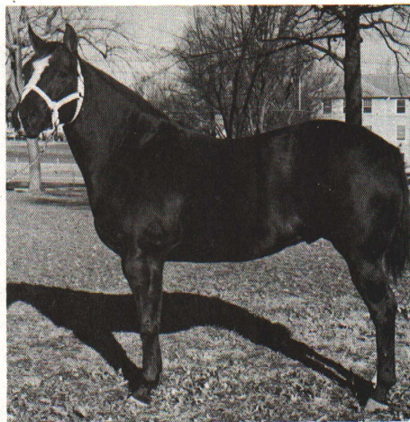
The same horse too fat for work and show