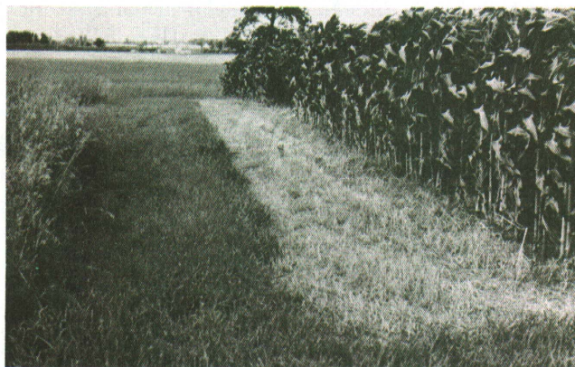
No-till corn planted in bromegrass sod at MSU.

Anhydrous ammonia has been successfully used in the no-till system and will reduce the need for frequent liming because it is incorporated rather than surface applied. Applicator knives should be equipped with rolling coulters ahead of each knife and a packer wheel behind to prevent escape of ammonia from the slit made by the knives. Applying urea or 28 percent nitrogen (50 percent urea) solution to crop residues may also result in sizable losses of nitrogen by ammonia