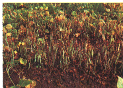
Fig. 1B—Defoliation resulting from rust in a Navy bean field in Saginaw County, 1974.

The results from the 1973 disease monitoring program (Table 1) illustrate the rapidity of rust disease development and spread under favorable conditions. These conditions include a susceptible host, presence of the pathogen, and favorable environment. Many plants were completely defoliated within two weeks after rust was first observed. In comparing the two seasons, it appeared that rust infection was much more critical to plant survival in 1973, a drought year, as compared to 1974, a non-drought year. This could be related to the presence of rust pustules on bean leaves, since the pustules provide an uncontrolled means for water to escape from the leaves. Hence, we would expect infected leaves on plants under a drought stress to wilt and fall off sooner than similarly infected leaves on plants under non-drought stress conditions.