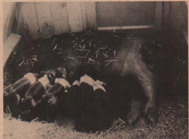
Portable farrowing house.

A crossbreeding program is recognized to be superior in raising feeder pigs or market hogs. Litter size, survival and growth rate are improved from 12 to 14% by multiple crossing (using 3 or more breeds) as compared to the average of the pure breeds used in the cross. Using three breeds in a rotational cross is preferred by most producers.