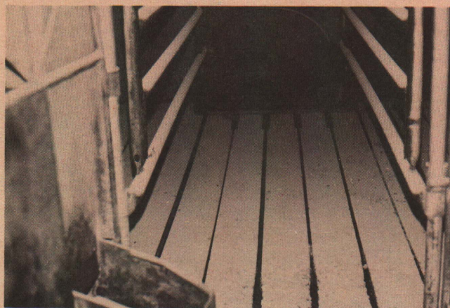
Farrowing crate with slatted floor.

Feeder pigs generally command the best prices when sold at 40 lbs; however, sometimes in the fall buyers prefer heavier feeders. Large lots of uniform