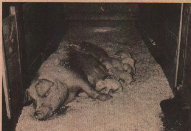
Farrowing pen in a barn.

Improvements can be made by selecting individual herd boars that excel in those traits most needed in a given herd. It is likewise important to place emphasis on selection of these same characteristics in each set of replacement gilts. Quite often, one of the sources of superior boars is the