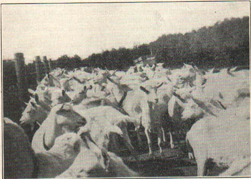
Fig. 1.—A herd of mature Saanen does.

The Saanen, developed in the Saanen Valley of Switzerland, is the largest of the Swiss goats. Mature does average about 135 pounds in weight. The desired color of Saanens is pure white, but some individuals have a creamy white coat. Although a few individuals have horns, this is considered a hornless breed. While the milk of this breed is hardly as high in fat content as the other breeds, Saanens are unsurpassed as milk producers and are rapidly gaining favor in America. The Saanen doe, Lydia Reed, produced over 21 pounds of milk in one day, and Selma of Three Oaks, another Saanen, produced 4,570.3 pounds of milk in twelve months.