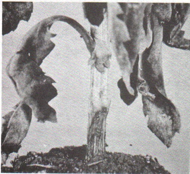
Fig. 1. Mature chrysanthemum with severe Rhizoctonia lesion on stem ("soreshin" symptom).