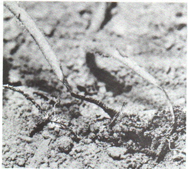
Fig. 2. Young seedling showing post-emergence damping-off ("wire-stem" symptom).