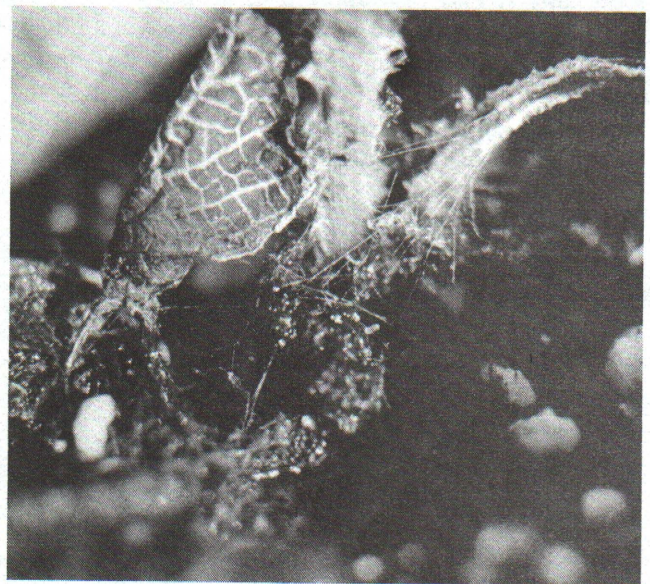
Fig. 4. Young Fittonia plant showing coarse fungus strands which often develop under warm, humid growing conditions.