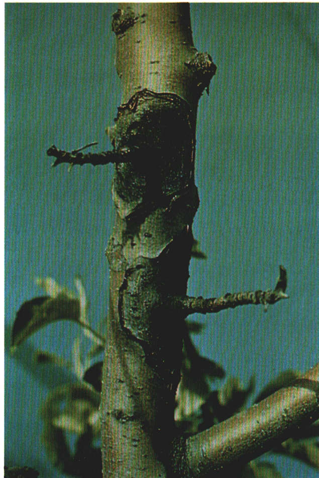
Figure 5. Fire blight canker on branch, note discolored bark and sunken margins.