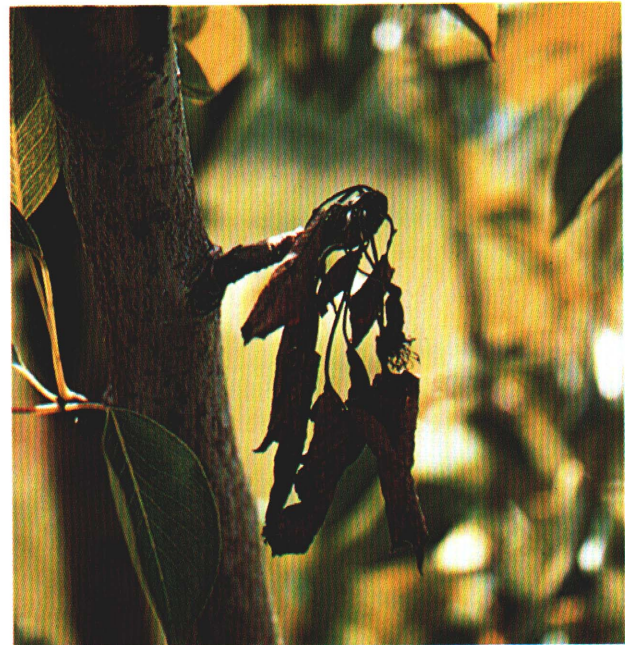
Figure 2. Spur blight stage of fire blight.