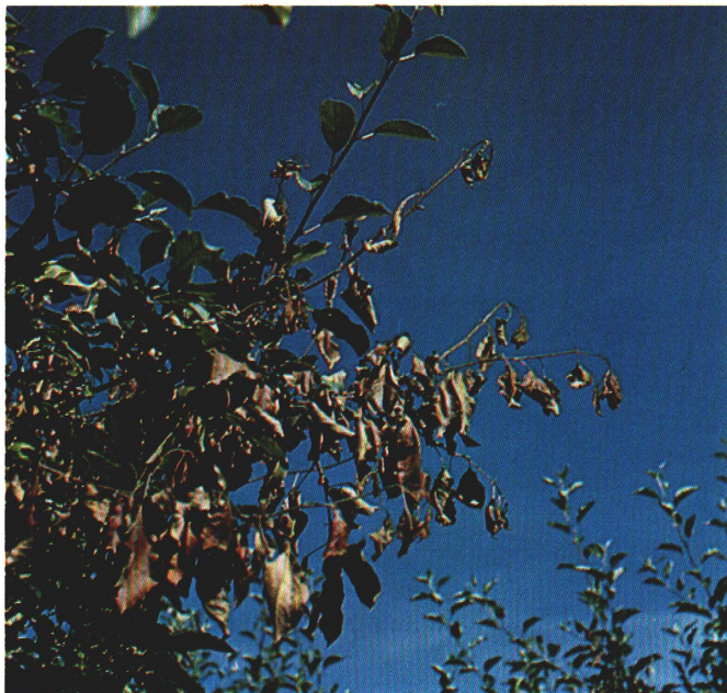
Figure 3. Wilting branches form a "shepherd's crook."