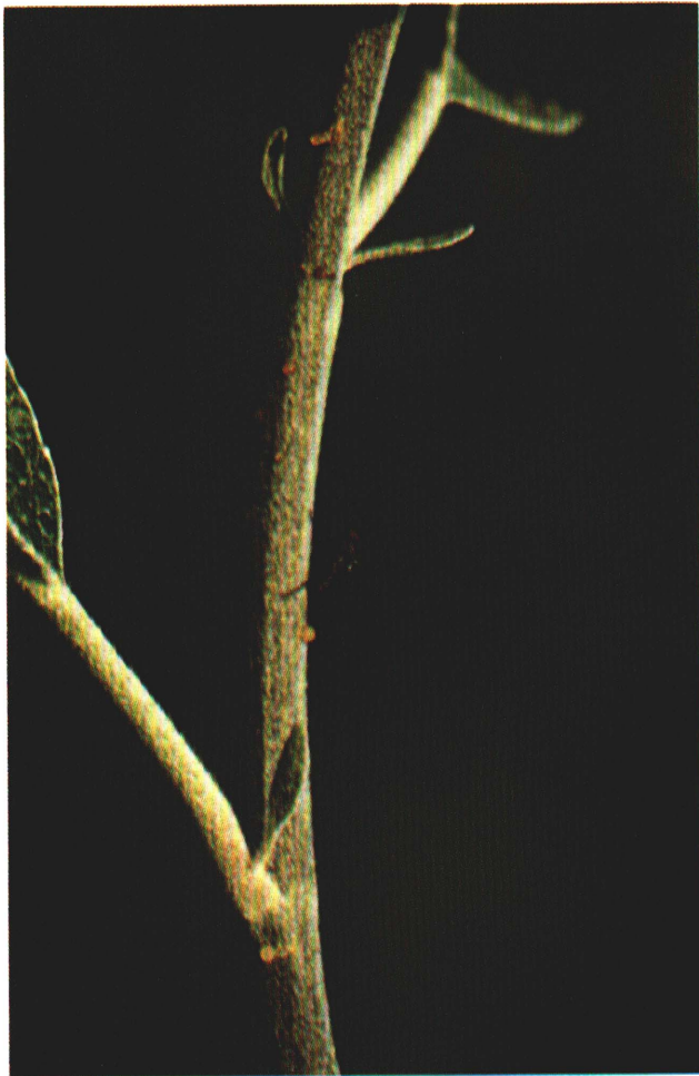
Figure 1. Bacterial ooze on a young shoot.

Bacteria enter the plant through blossoms, fresh wounds or natural openings, where they multiply and spread intercellularly. Blossoms and young fruit are often attacked (Fig. 2). At first, infected tissues appear dark green and water-soaked, but they soon shrivel or wilt, turning brown to black. Newly infected shoots wilt from the tip back towards the trunk, forming a "shepherd's crook" or bend at the tip (Fig. 3, page 4). The resulting shriveled leaves and fruit may remain on the tree long after normal defoliation has occurred. (For a complete illustration of the fire blight life cycle, see figure 4.)