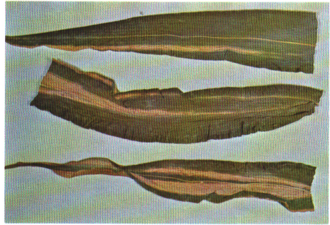
Stewart's Bacterial Leaf Blight. Lesion usually has irregular, wavy margin and extends along leaf vein.

The causal bacterium overwinters in the corn flea beetle. In the spring, the insect carries the bacterium to the young corn plant and deposits it while feeding. The bacterium rapidly multiplies in conductive tissues of corn leaves. At first, long, pale-green-to-yellowish streaks appear along a vein. These streaks enlarge sideways with irregular margins and the areas