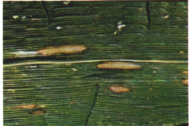
Yellow Leaf Blight. Fungus Pycnidia appear as tiny specks within lesion — visible with small magnifying glass.