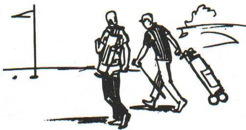
Fun For User.

The trap becomes one of deciding what measures are to be used to gauge success. Gross or net income or possibly net worth are generally used as indicators of success. Others argue that success can only justifiably be measured when