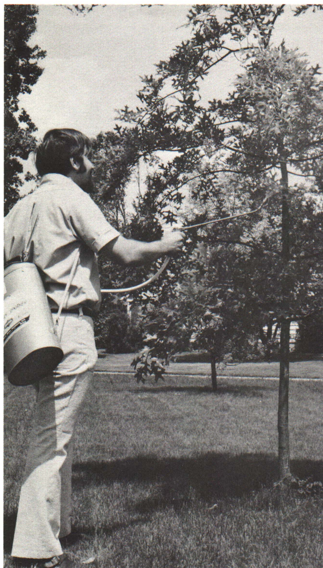
Figure 7. Foliar sprays containing iron in an available form are often effective in correcting chlorosis. Longer lasting treatments for preventing lime-induced chlorosis involve soil applications of iron chelates.

Presently there are a number of commercial materials (devices) available to assist homeowners in fertilizing shade and ornamental trees. These include such items as root feeders, trunk implants, fertilizer stakes, and other similar products. Although they offer convenient methods for fertilizing trees their effectiveness has not been thoroughly documented