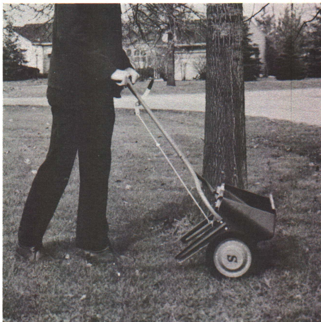
Figure 3. Nitrogen fertilizers can be applied to the soil surface with a lawn fertilizer spreader. The spreader should be calibrated to insure accurate delivery.

Holes should be made in concentric circles around the trunk of the tree. The first circle should be no