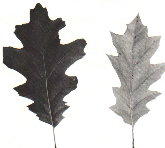
Figure 1. Yellowish-green color between the veins and along the margins (edges) of leaves may be an indication of chlorosis (right). This condition is most often associated with a lack of available iron in the soil. Note normal leaf on left.

Manufactured fertilizers differ in the amount of nutrients they contain (Figure 2). This difference is apparent when one looks at the expressed analysis (grade). Fertilizer analyses are commonly expressed with three numbers, e.g., 10-6-4. The first number (10), in this example refers to the percentage of elemental nitrogen (N) present, the second number (6), to the phosphorus (P) content expressed as percentage P_2O_5 (phosphate) and the third number (4), to the percent potassium (K) in the form of K_2O (potash). Since many different analyses are available, it is important to understand that a fertilizer with a grade of 16-8-8 contains 60 percent more nitrogen, 33.3 percent more phosphorus ( P_2O_5 ) and 100 percent more potassium ( K_2O ) per pound of fertilizer than a pound of 10-6-4. This difference can be made more meaningful by realizing that 37.5 pounds of 16-8-8 would be