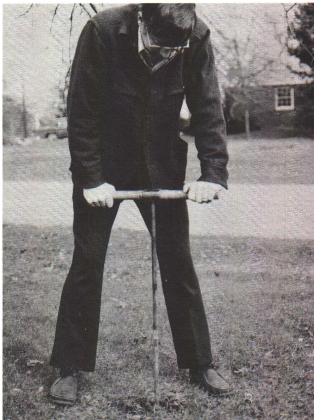
Figure 4. Use a soil auger to make holes beneath the tree for fertilizer. Holes should be approximately 1½ to 2 inches in diameter and about 12 to 15 inches deep.