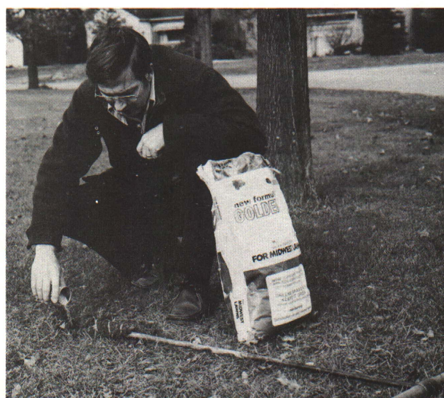
Figure 6. After pouring the fertilizer in the hole, fill the hole with peat or other organic material.